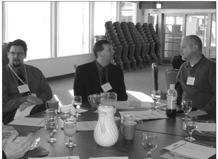
Participants engaged between presentations at the Meeting.